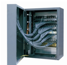
102.118 rear view open