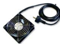
203.171 and 201.171