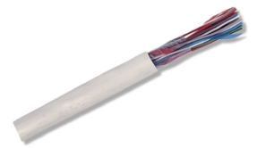
38 56 54