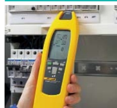
Location of fuses/breakers and assignment to circuits